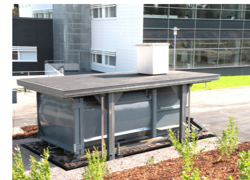
HABA MEGA in Helsinki

HABA MEGA has won several international innovation awards, and reference customers can be found in many large cities, such as Moscow, Dubai, Stockholm, Zurich and Helsinki.